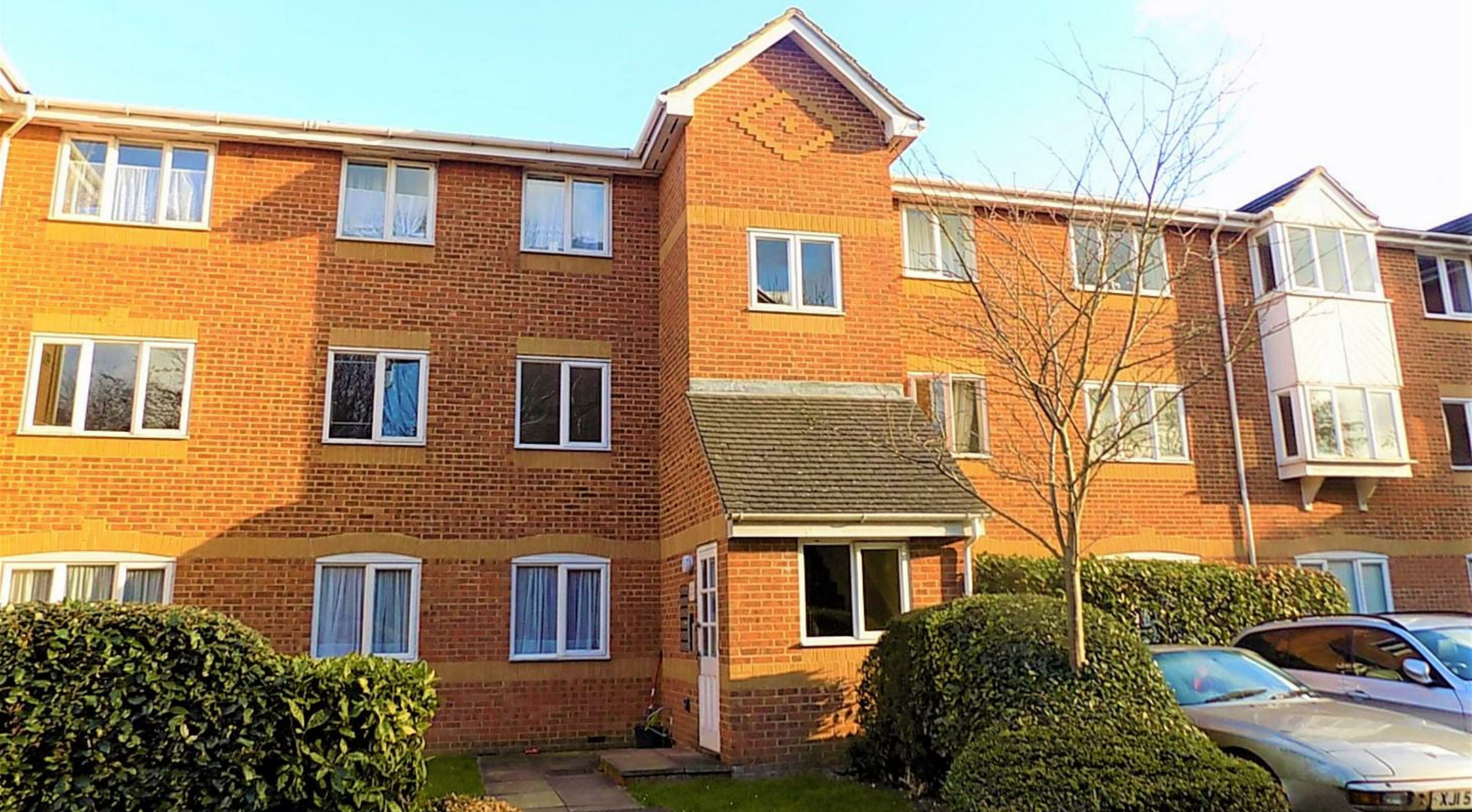
Ascot Court, Aldershot